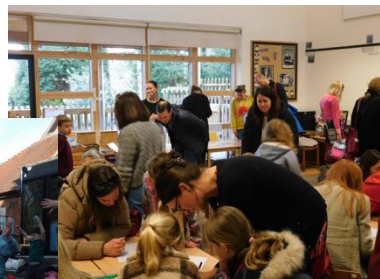
open classroom event