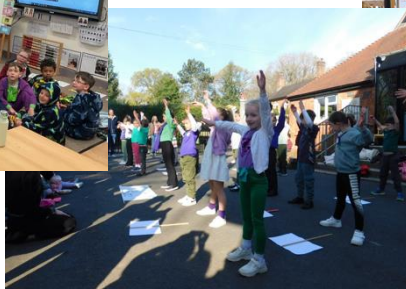
Singing on the Steps