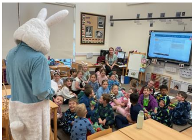
Easter Story Night