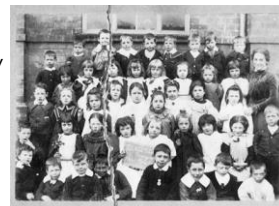
Pupils at our school!

Computing learning this half term will focus on using technology to create different things such as word documents/paintings. PSHE will focus on changes and moving on as we prepare the children for their smooth transition to Purple Class.