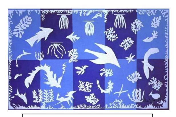
La Mer by Henri Matisse