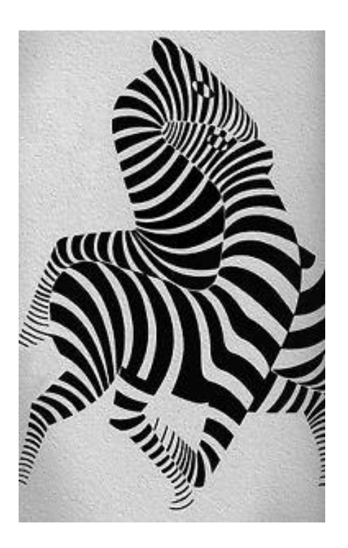
Zebras by Victor Vasarely