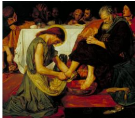
Ford Madox Brown- Jesus washing Peter's feet