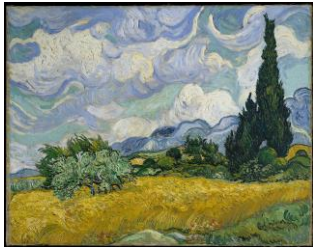
Van Gogh- Wheat Fields with Cypresses

This week our theme is Humility and the daily whole school times to reflect on 'big questions' will consider the importance of humility by considering charitable causes, including 'Sport Relief, the significance and message behind the story of Jesus washing the feet of his disciples from the Bible and our own ability to be humble. We will consider the painting of 'Jesus washing Peter's feet' by Ford Madox Brown and Van Gogh's painting of the 'Wheat Fields' to consider the fate of the sheaf of corn that rises above all of the others in an attempt to help the children understand our collective work, rather than the effort to rise above others.