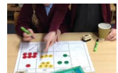
using concrete apparatus to help understand column addition