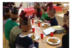
tucking into our delicious Christmas dinner