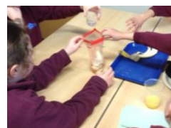
having lots of fun learning about the digestive system