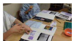
printing in Art