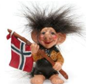
and now we're off to Norway!