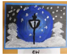
artwork inspired by the C.S. Lewis classic 'The Lion, the Witch and the Wardrobe'