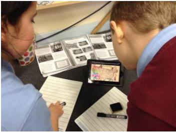
Life returns to 'normal' in school as children work together on projects and enjoy their time in school.