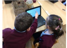
In Green Class, the children's developing computing skills are being demonstrated on the new laptops.