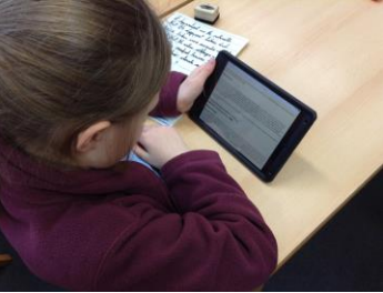
The PFTA funded ipads and laptops last year and in these photographs you can see how they are being used to teach new computing skills as well as research skills in History.