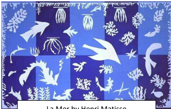
La Mer by Henri Matisse