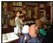
In the Victorian grocers