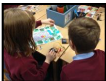
Sharing rainforest board games with friends

During Numeracy, children will be consolidating and developing their use of mental and written calculations for multiplication and division, their understanding of fractions and the application of these skills when problem solving. Mental maths will focus on adding and subtracting any 2 2-digit numbers using a range of efficient methods, doubling and halving numbers to 100 fluently (even numbers only for halving) and counting on and back from zero in tenths and in steps of 25, 50, 100 and 1000. The 3 times table will be the focus for the next few weeks.