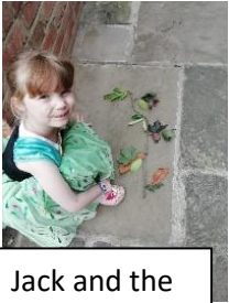
Jack and the beanstalk art