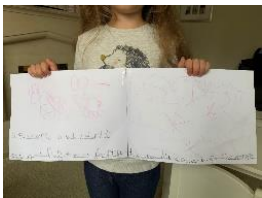
Evie's story writing. Wow!